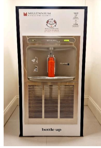
Water refill station at Millennium Gloucester

In conjunction with the roll out of green meetings across UK hotels, 11 water refill stations were installed at five locations (as at 31 December 2023). Our installed machines had refilled 91,622 (500ml) bottles from installation to 1 February 2024, diverting 91,622 bottles from landfill.