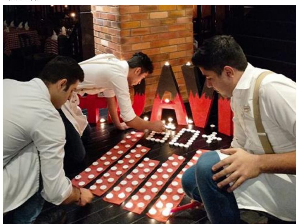
Staff at Millennium Airport Hotel Dubai preparing for Earth Hour by lighting candles in the hotel lobby

Earth Hour is a global initiative that started in 2007 and has since grown into a massive movement that brings together people from all over the world to take a stand against climate change. The event takes place every year on the last Saturday of March, and during this time, people are encouraged to turn off all non-essential lights for an hour, between 8:30 pm and 9:30 pm local time.